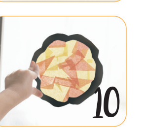
Your poppy suncatcher is ready!