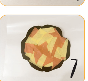
Paste the tissue pieces on the inside of the poppy covering all the exposed