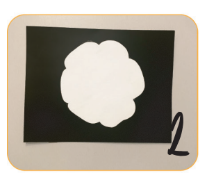
Trace the bigger poppy on to the cardstock paper.