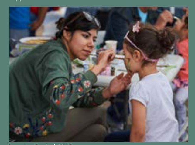
Poppies Festival 2017