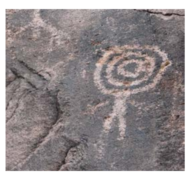
Figure at Anchondo Casas Grandes Culture (AD 1200 – 1450)

The Rocks Speak: Petroglyphs of the Casas Grandes Region exhibit focuses on three petroglyph sites near the archaeological site of Paquimé located in Chihuahua, Mexico. Assumed to date predominantly from AD 1200 - 1450 these petroglyphs include "bird men," horned serpents, a priestly figure wearing a horned serpent headdress, concentric circles, stick figures, stepped patterns, and other unique designs. This exhibition complements Paquimé and the Casas Grandes Culture, our larger exhibit in the Museum's North Gallery.