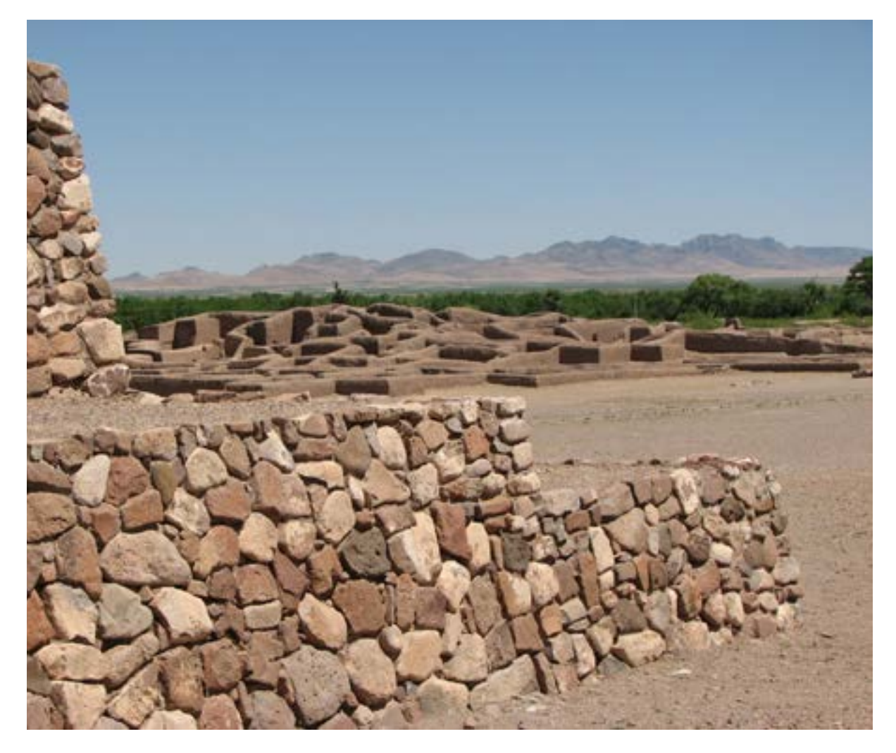
Paquimé Casas Grandes Culture (AD 1200 – 1450)