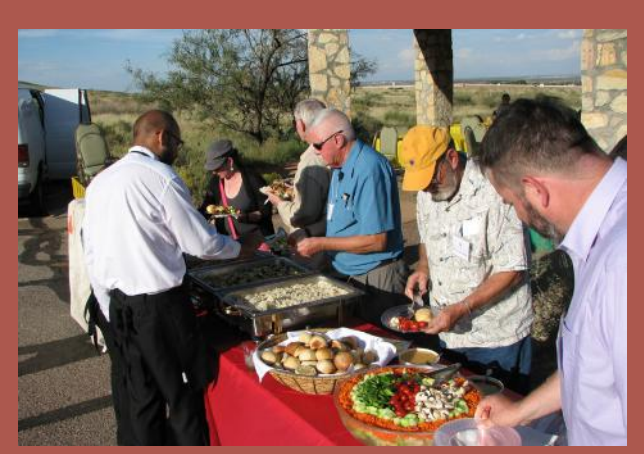
Dinner for guests at the Jornada Mogollon Conference.