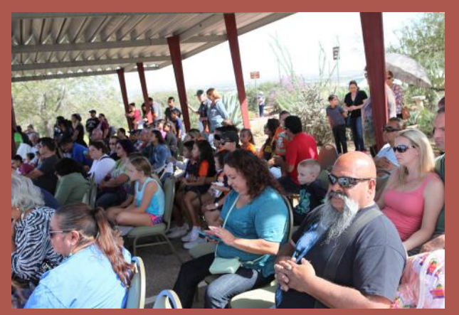
209 people attended the Museum's 40th Anniversary celebration.