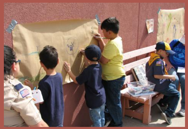
Children painting petroglyphs at a family day event.