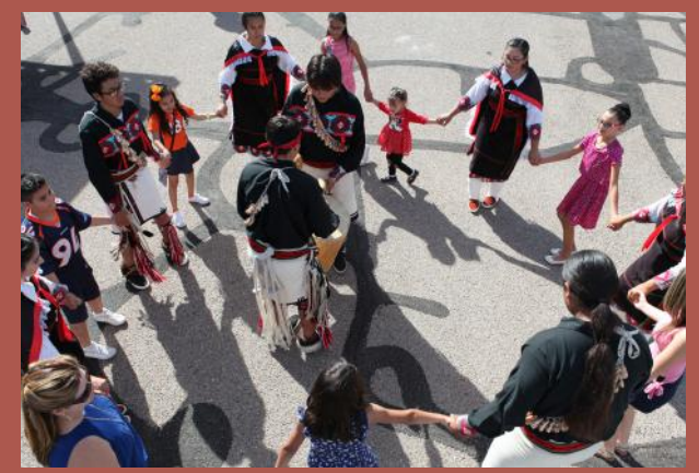
Community Dance with the Tigua Youth Dancers