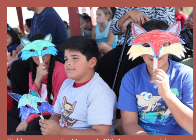
Children enjoying the Museum's 40th Anniversary celebration.