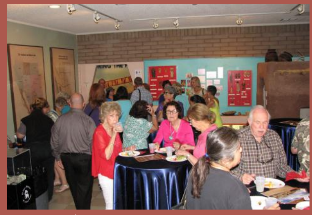
Museum members enjoy a private reception.