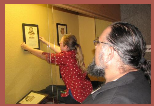
EPMArch staff members installing the Tom Lea exhibit.