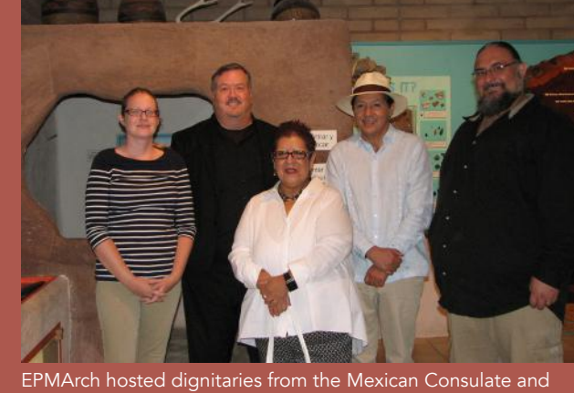
Centro INAH Sonora.